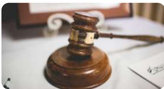
LPNABC gavel that was made 60 years ago and used all AGMs.