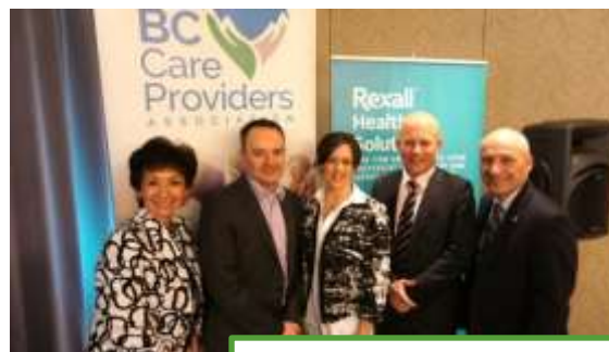
LPNABC guest speaker at BCCPA Care To Chat April 2017 announcing support for funding to increase LPNs and HCAs increasing direct care hours.