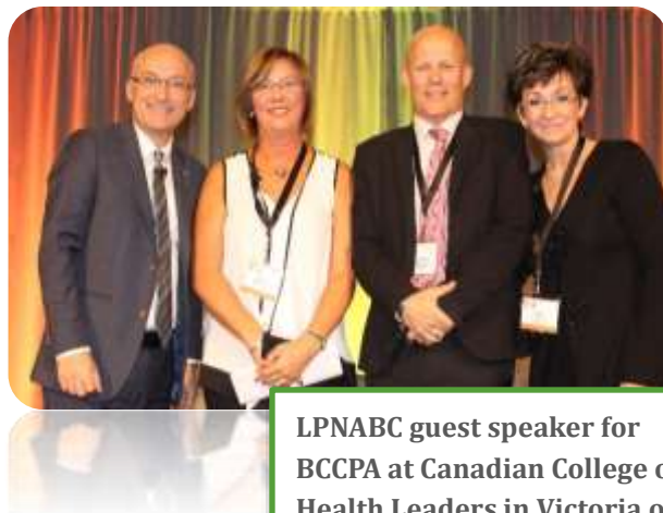
LPNABC guest speaker for BCCPA at Canadian College of Health Leaders in Victoria on October 13, 2017.