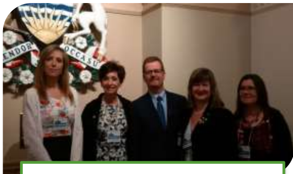
LPNABC attending Legislation Day in May 2014 with Hon. Terry Lake