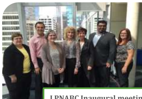
LPNABC Inaugural meeting with BC Coalition of Nursing Associations in 2015