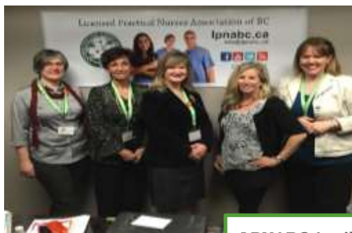
LPNABC April 2015 Board Members at AGM.