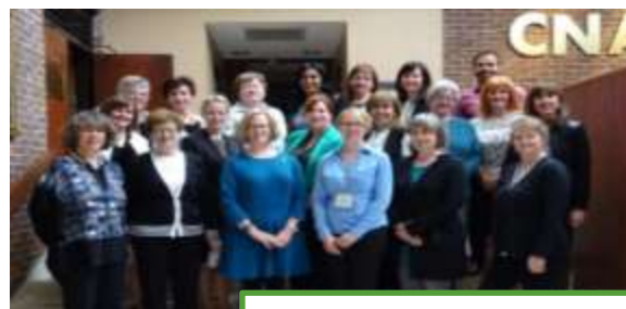
LPNABC & PN Canada representing LPNs at CNA Board meeting and conference June 2016