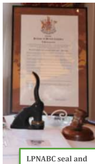
LPNABC seal and proclamation for LPN Day.